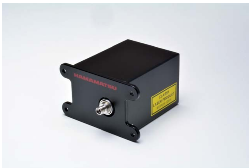
FTIR engine C15511-01